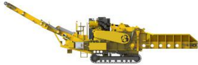
Magnum Force 5800B

Features the same principles of the CBI 6800B horizontal grinder but is purpose-built for contractors dealing with lower production needs or transportation restrictions. 63,000-69,000 lbs, CAT C-18 engine; 765 HP, 40"D x 48W rotor.