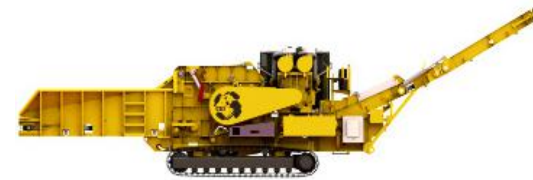
Magnum Force 6400

Meets the demands of grinding contractors looking for a one-man grinding solution. Designed to be pulled by a truck with a log loader, the infeed and radial discharge rotate left and right 60 degrees for loading and stacking of material on both sides of the machine. 77,000 lbs, CAT C-18 engine; 765 HP, 40"D x 48"W rotor.