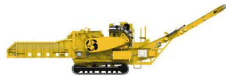
Magnum Force 5400

Processes an exceptionally wide variety of materials and generates the products that your clients demand – all with a single machine. 70,000 - 76,000 lbs, CAT C-18 engine; 765 HP, 40"D x 48W rotor.