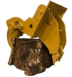
Direct Pin Stump Shear

The CBI Stump Shear grubs, pulls, shears, backfills, and loads stumps and logs at a rate of 50+ tons/hour. Direct pin models available, designed to fit 40,000 - 100,000 pound class excavators with an auxiliary hydraulic line for the additional piston that powers the cutting knife.