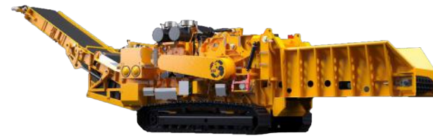
Magnum Force 6800C

Features the same principles of the CBI 6800B horizontal grinder but is purpose-built for contractors dealing with lower production needs or transportation restrictions. 63,000-69,000 lbs, CAT C-18 engine; 765 HP, 40"D x 48W rotor.