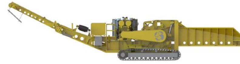
Magnum Force 8800

Automatically detects tramp metal through impact sensors on the rotor. The feed roll lifts, feed system reverses, engine speed is reduced, clutch is disengaged and engine shuts down before metal enters the mill.