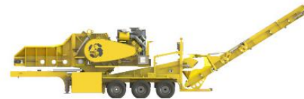
Magnum Force 5400 Multiflex

Processes an exceptionally wide variety of materials and generates the products that your clients demand – all with a single machine. 70,000 - 76,000 lbs, CAT C-18 engine; 765 HP, 40"D x 48W rotor.