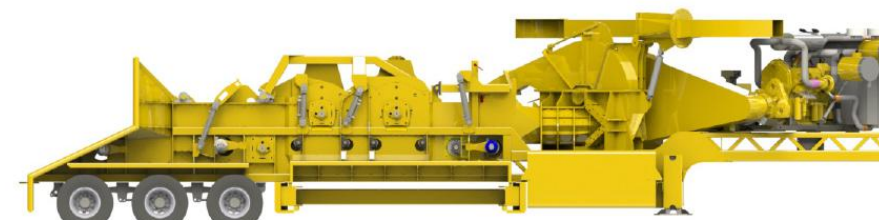
CBI 7544 Flail & Chipper

The 604NL four-roll flail design guarantees maximum debarking action to assure owners earn a timely ROI through a quality end product. 84,000 lbs, C-18 engine; 600 HP CAT, 40"D x 60"W flail drum.