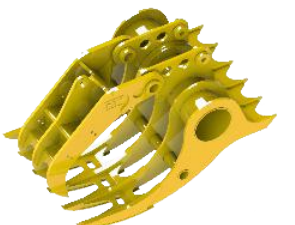
RR30 Root Rake and Thumb

The CBI Quick-Coupling Stump Shear is excavator-mounted and performs many separate tasks. This shear is designed to fit on 40,000 - 100,000 pound class excavator and makes swapping attachments quick and easy adding to machine versatility.