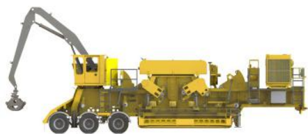
Magnum Force Flail 604

Engineered to be the industry's most rugged and productive delimeter/debarker, capable of processing logs up to 24" in diameter. 98,000 lbs, CAT C-18 engine; 600 HP, 40"D x 60"W flail drum.