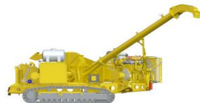
Magnum Force Disc Chipper 754

Engineered to be the industry's most rugged and productive delimeter/debarker, capable of processing logs up to 24" in diameter. 98,000 lbs, CAT C-18 engine; 600 HP, 40"D x 60"W flail drum.