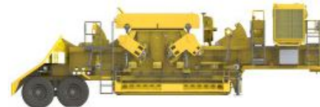
Magnum Force Flail 604NL

Capable of producing high-quality wood chips from 3/8"– 1" at up to 200 tons per hour. 94,500 lbs, CAT C-27 engine; 1050 HP, 75"D 4-knife chipper disc with babbited or Key Knife system.