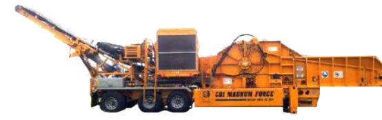
Magnum Force 8400

Owners can transform this whole tree grinder/chipper into a machine built for grinding contaminated demolition debris just by swapping the rotor and screens. 83,000 - 90,000 lbs, CAT C-27 engine; 1050 HP, 40"D x 60"W rotor.