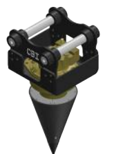
Log & Stump Screw

It grubs, pulls, backfills, rakes and loads to make "hog feed" out of dirt contaminated debris. The CBI Root Rake is built with the same rugged durability you have come to expect from CBI.